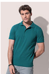
ST9060 Harper Polo