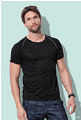
ST8030 Active 140 Team Raglan